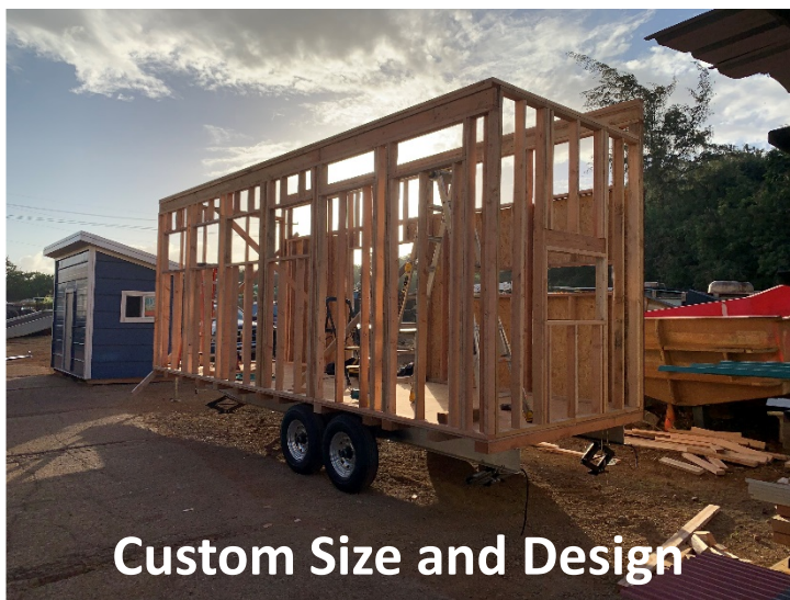
Custom Size and Design