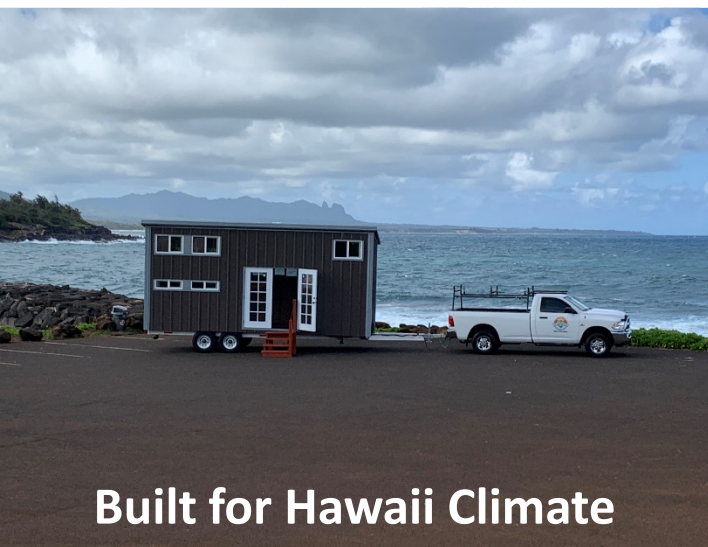
Built for Hawaii Climate